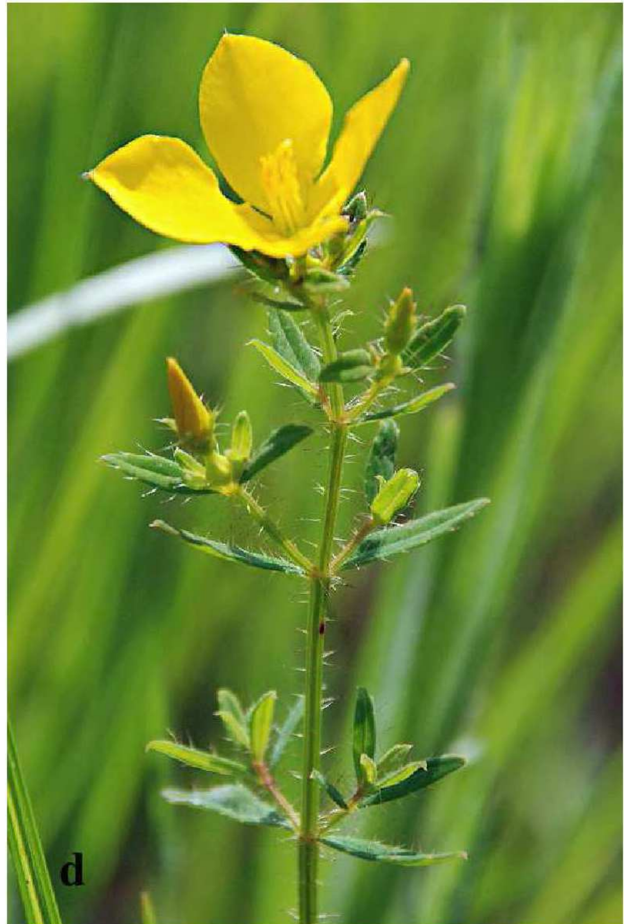
Figure 3a, b, c, d. Representative species of the four sections. a. Rhexia alifanus . b. Rhexia virginica . c. Rhexia petiolata . d. Rhexia lutea .